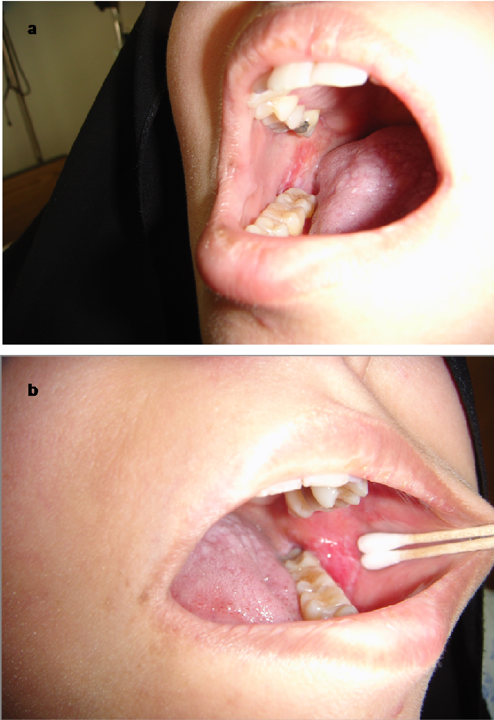
Figure 1. Lacelike plaques on buccal mucosa bilaterally.

it was observed that she was afebrile with BP 104/60, and was pale with no jaundice. Oral examination showed whitish lacelike plaques on the buccal mucosa opposite the lower molar teeth bilaterally (Figure 1a and b). She