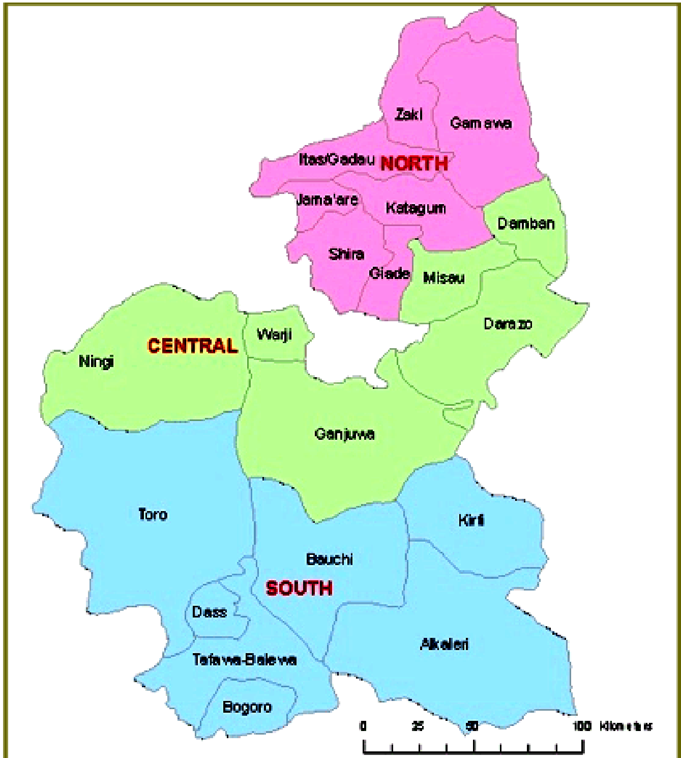
Figure 1. Bauchi State map indicating the three zones of the study areas, that is, North (Katagum), Central (Ningi) and South (Bauchi).

underlying a set of measures and a set of items forming an instrument that all measure one thing in common. The first fit measure to be reported in this study is the Chi-