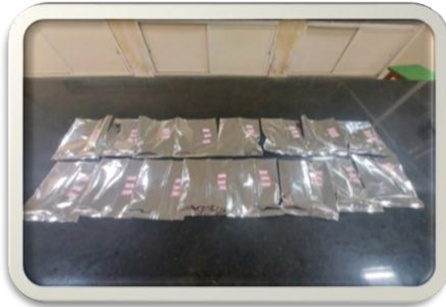
Plate 1. Shelf-life Studies

was opened and 11g of the product was weighed and transferred to 99 ml of the sterile physiological saline aseptically. Further dilution to the desired level was carried out by serially transferring 1ml of diluted sample to 9 ml sterile diluent blanks (FSSAI, 2016) Plate 1.