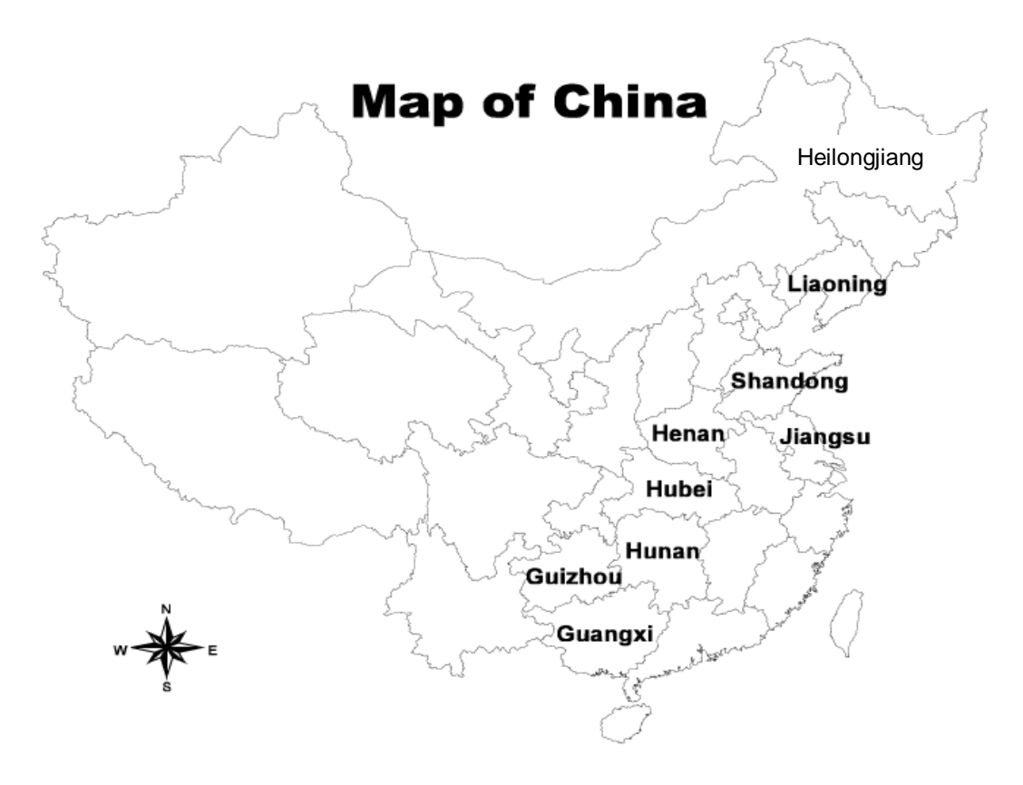
Figure 2. Location of surveyed provinces.

to one-child family and more than 22% of the villages offer health-care subsidy to one child family), but indeed the share of the village that offers subsidy to one-child family varied considerably within a province. For instance in Jiangsu, while more than 80% of the villages offer subsidy to one-child family from 1989 to 1997, just more than 40% of the villages offer subsidy to one-child family from 2000 to 2004. Similar decline in health-care subsidy is also observed in Hubei. Villages that offered healthcare subsidy to one child family decreased from over 60% in 1989 to less than 20 percent in 2004.